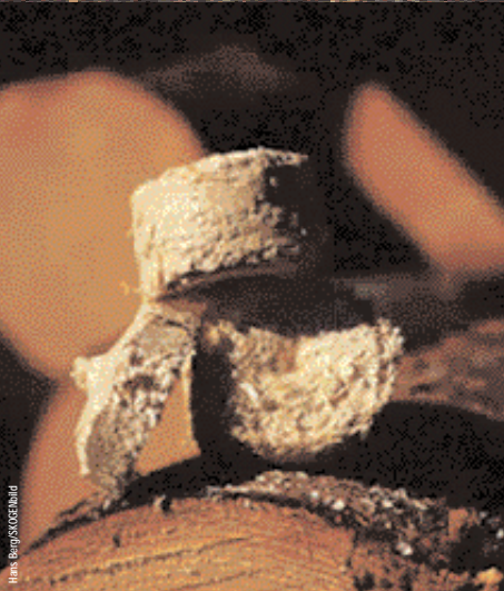
see SVEBIO 04