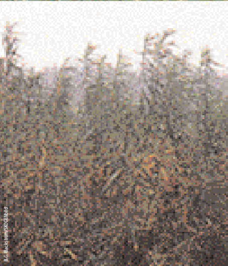
see SVEBIO 04