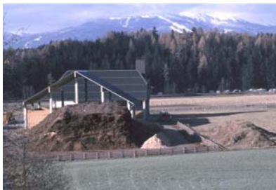
Source: The Tamsweg DH plant